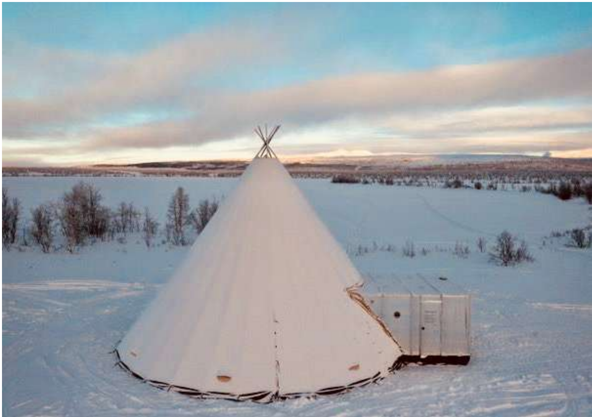
Boaššu / NOMAD Indigenous FoodLab in the field, Guovdageaidnu, March 2022.