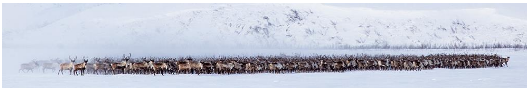
Canadian Reindeer Herd.

There has been good progress on outreach and knowledge development activities, and especially so regarding EALLU and Rievdan WP3. GEF/ UNEP Nomadic Herders has also had good progress, the external conditions taken into account.