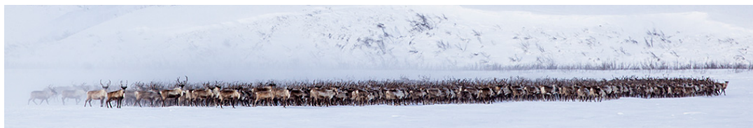
Pic: Canadian Reindeer Herd.